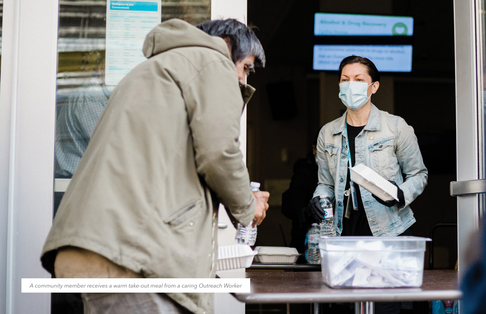
A community member receives a warm take-out meal from a caring Outreach Worker